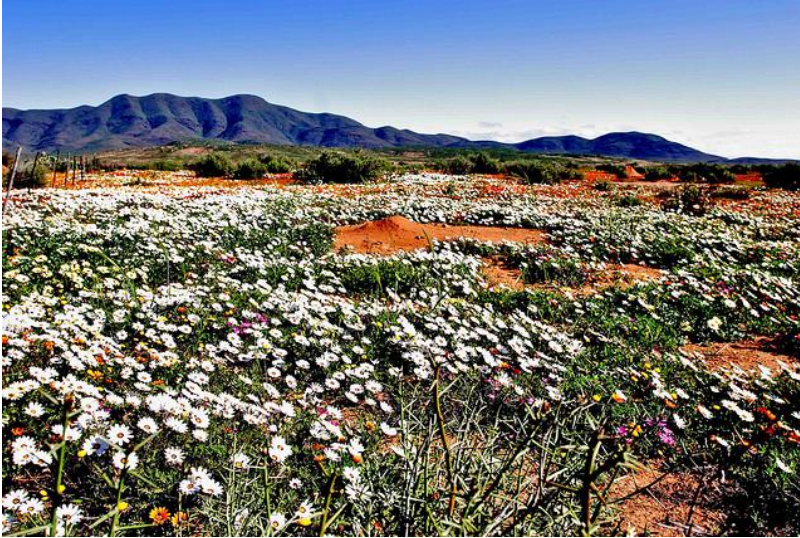
(Right) Flower fields in spring on the South African West Coast