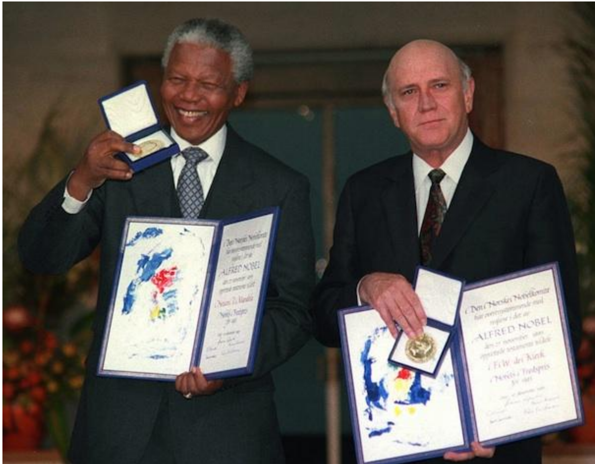
Nelson Mandela and F.W. deKlerk receive Nobel Prize in 1993

negotiations that led to multi-racial democracy in 1994. In 1994, elections were held in South Africa with universal suffrage; for the first time, all South Africans, irrespective of race, were able to vote. The ANC was voted into power and Nelson Mandela became President of South Africa. From 1990 to 1996, the legal apparatus of apartheid was abolished and consequently international trade sanctions and embargoes, as well as cultural boycotts were lifted so that South Africa could become a fully participating member of the international community.