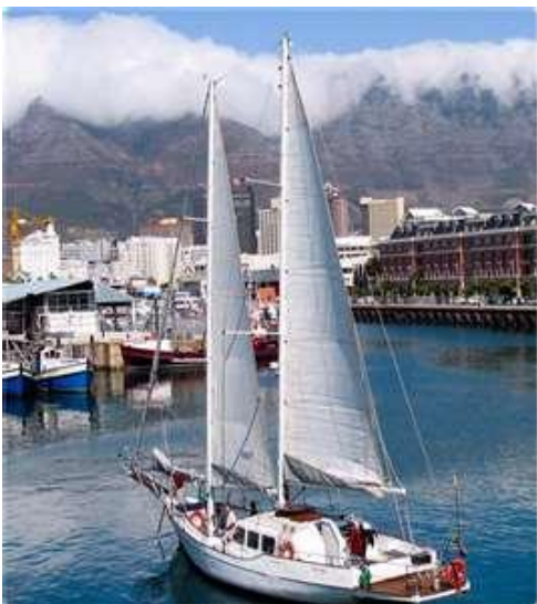
(Left) The Port Town of Cape Town in the province of Western Cape, South Africa