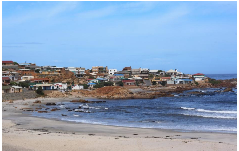
(Right) The coastal town of Strandfontein on South Africa's West Coast